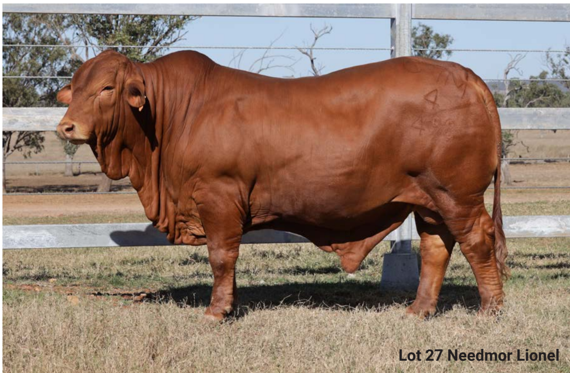
Lot 27 Needmor Lionel