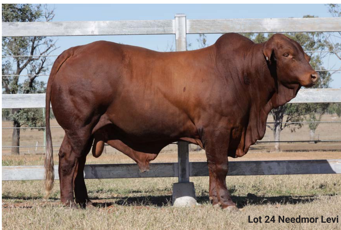
Lot 24 Needmor Levi

DOB: 11/11/2023 (22 months) REG NO: C7M23469M