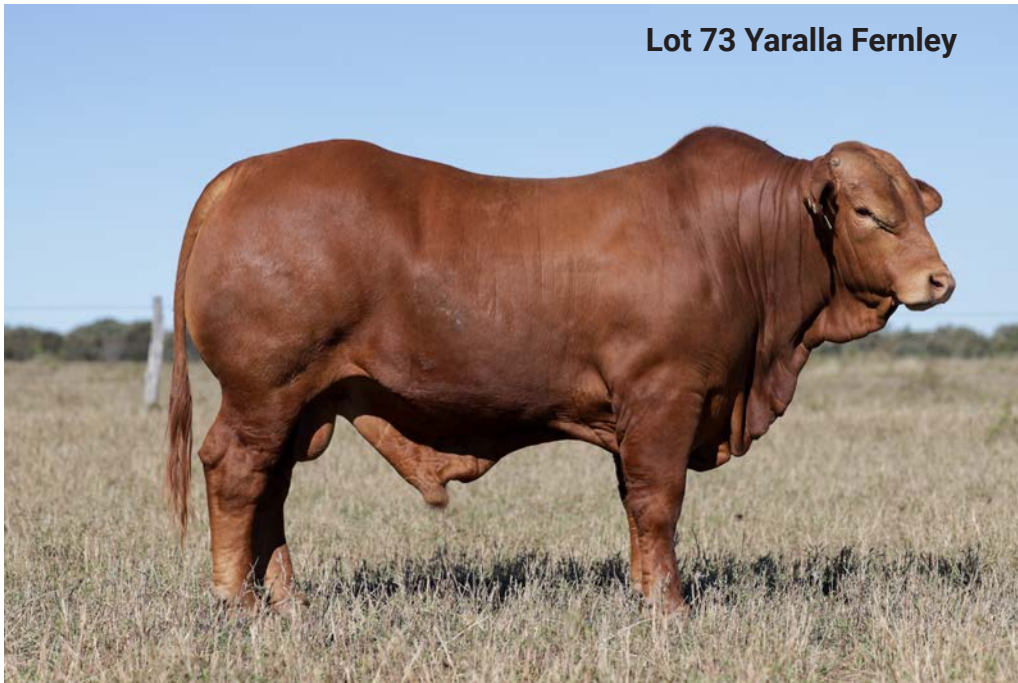
Lot 73 Yaralla Fernley

DOB: 18/10/2023 (23 months) REG NO: IPC24170M