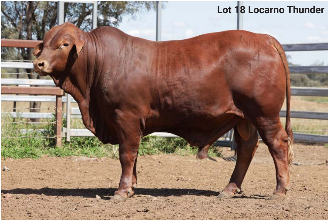
Lot 18 Locarno Thunder

DOB: 5/10/2023 (23 months) REG NO: NN2241160M