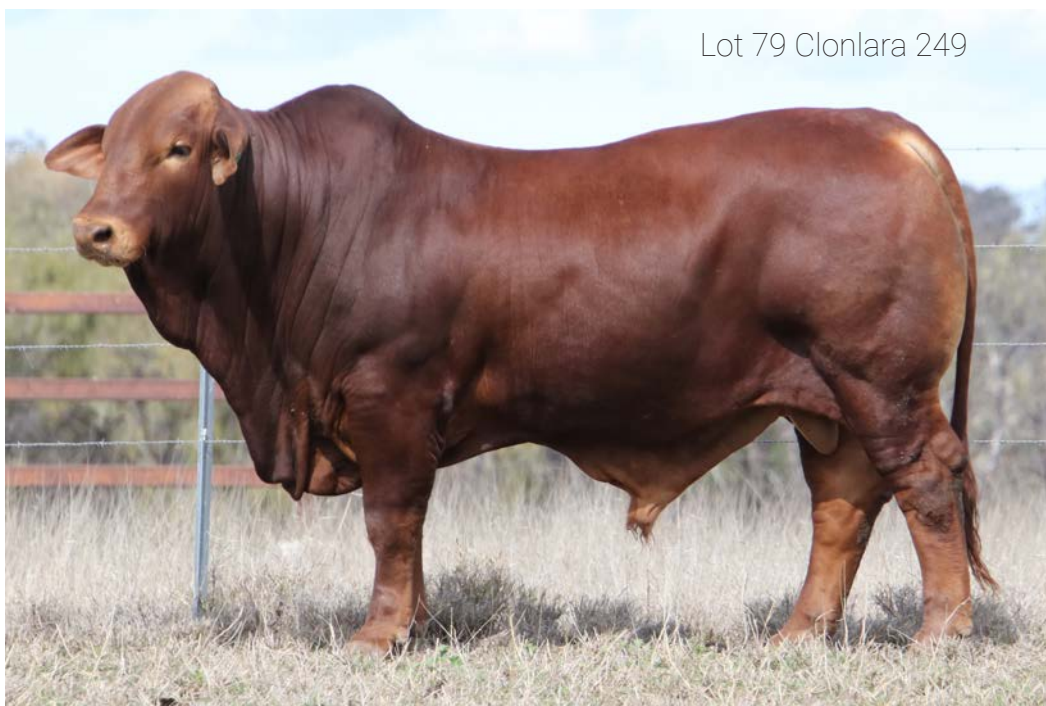
Lot 79 Clonlara 249

Comments: 22155 - Two calves in 2 years since first calving as a 2 year old. 249 is her first & a weaner. She is currently PTIC.