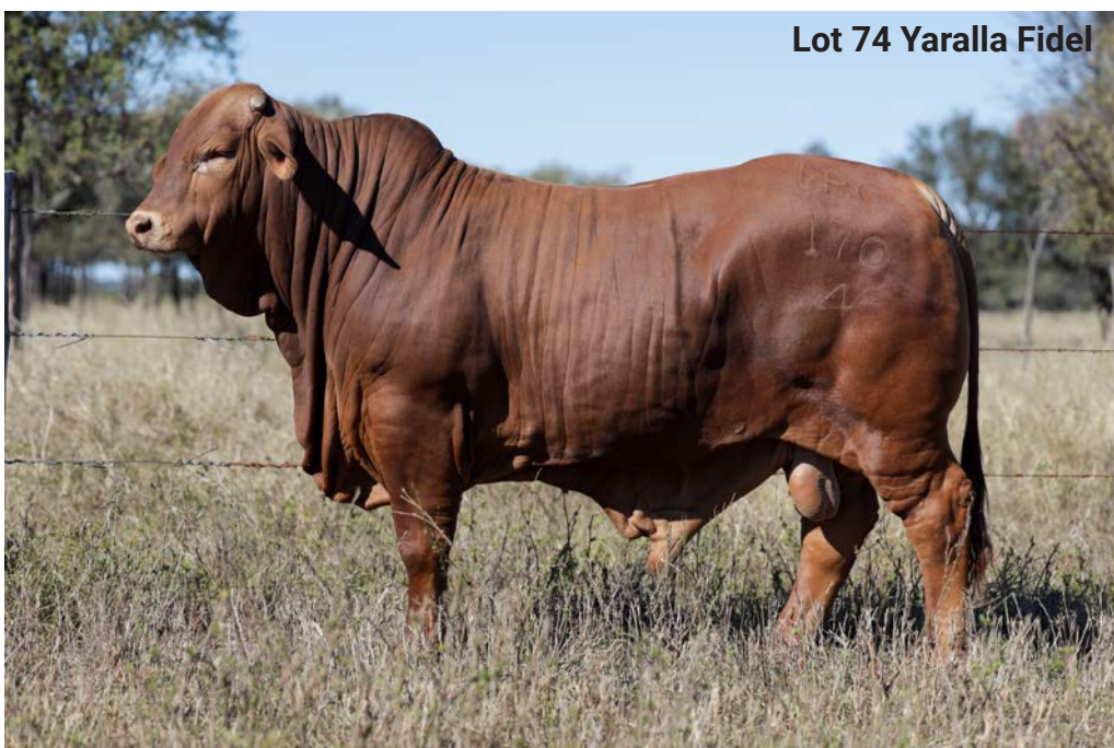
Lot 74 Yaralla Fidel