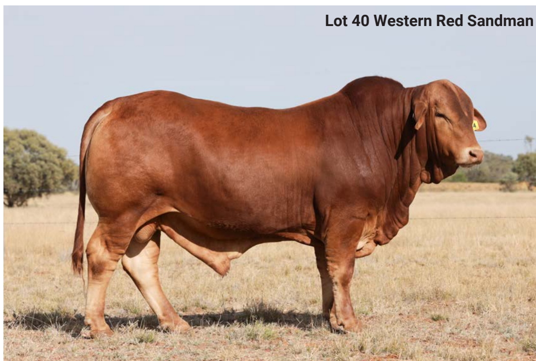
Lot 40 Western Red Sandman