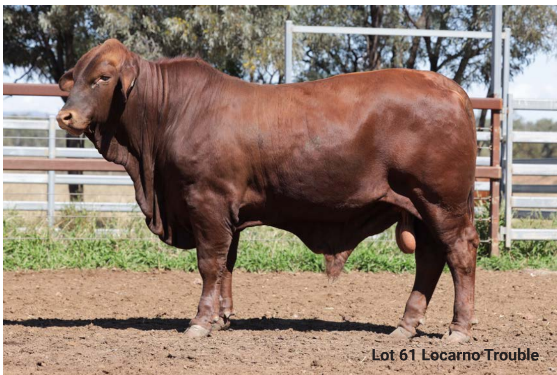
Lot 61 Locarno Trouble