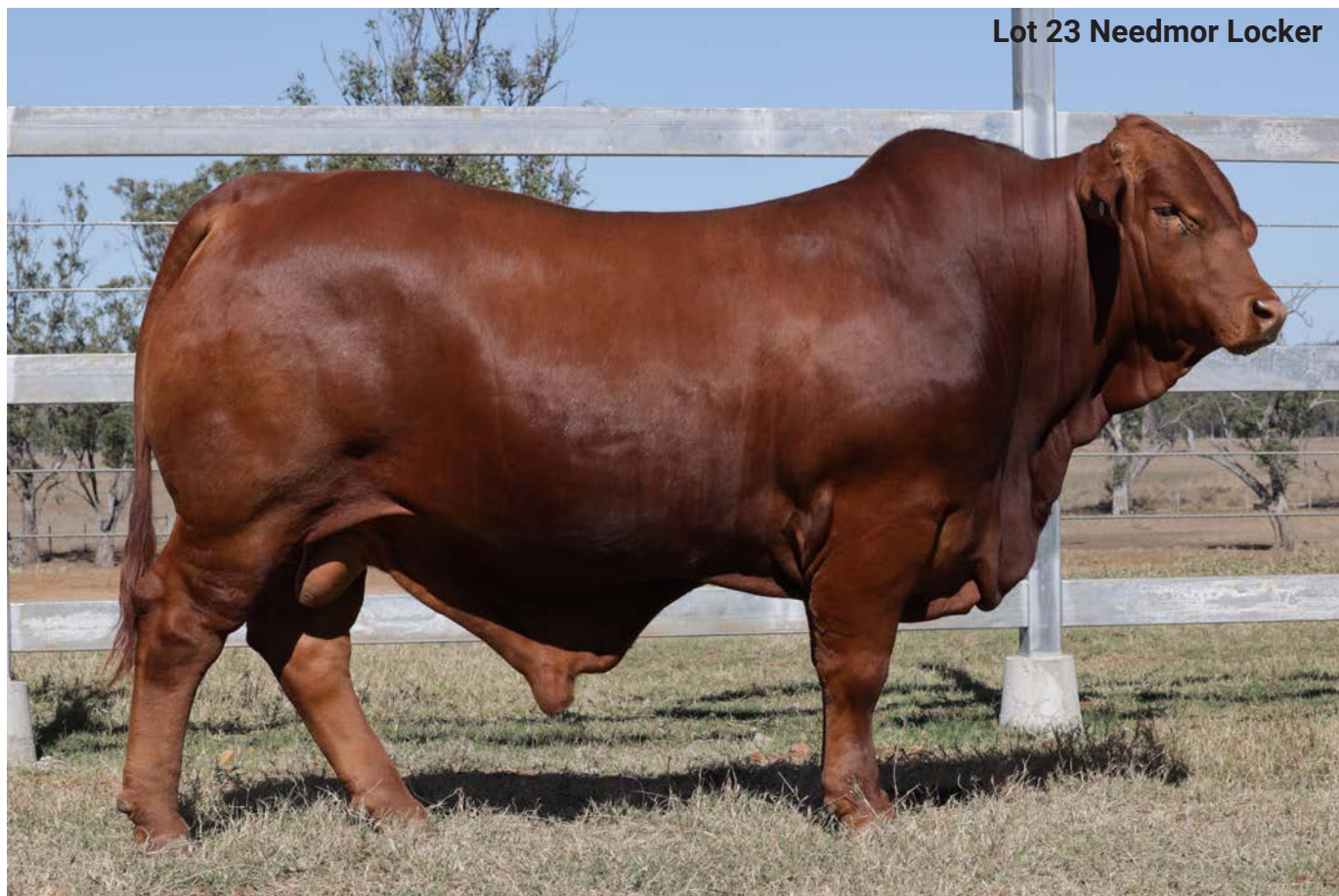
Lot 23 Needmor Locker