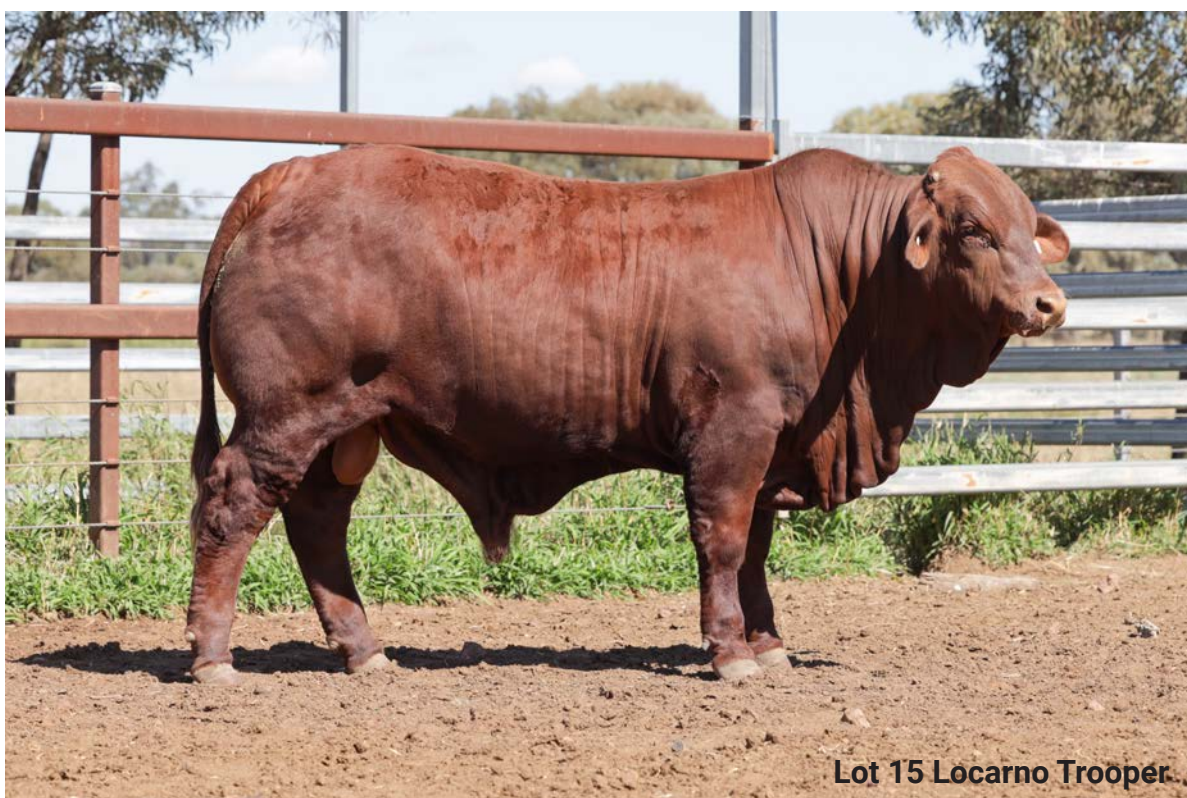
Lot 15 Locarno Trooper