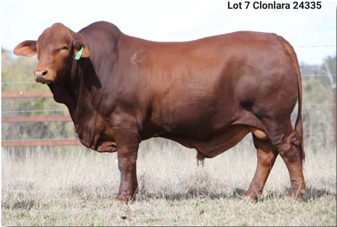
Lot 7 Clonlara 24335