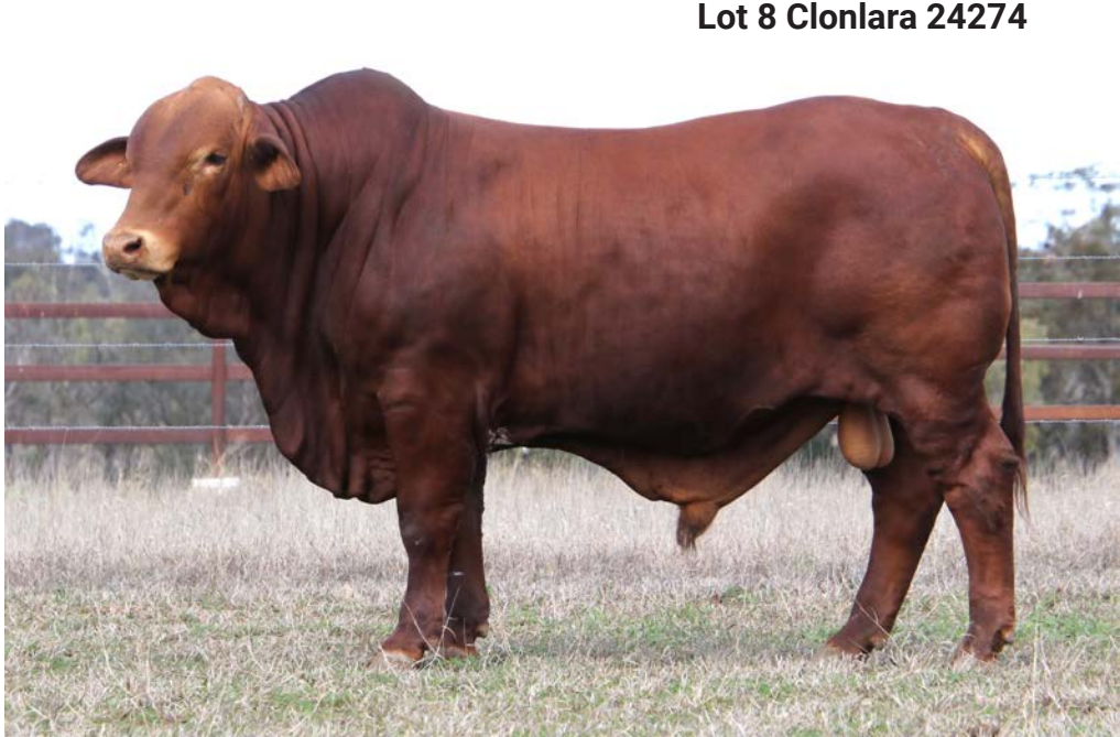
Lot 8 Clonlara 24274

Comments: 18260 - Six calves in 6 years since first calving as a two year old. Two heifers, one is retained. Three bulls, two sold to average $6000 and 24274. She has just weaned another calf and is currently PTIC.