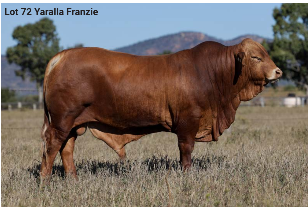
Lot 72 Yaralla Franzie