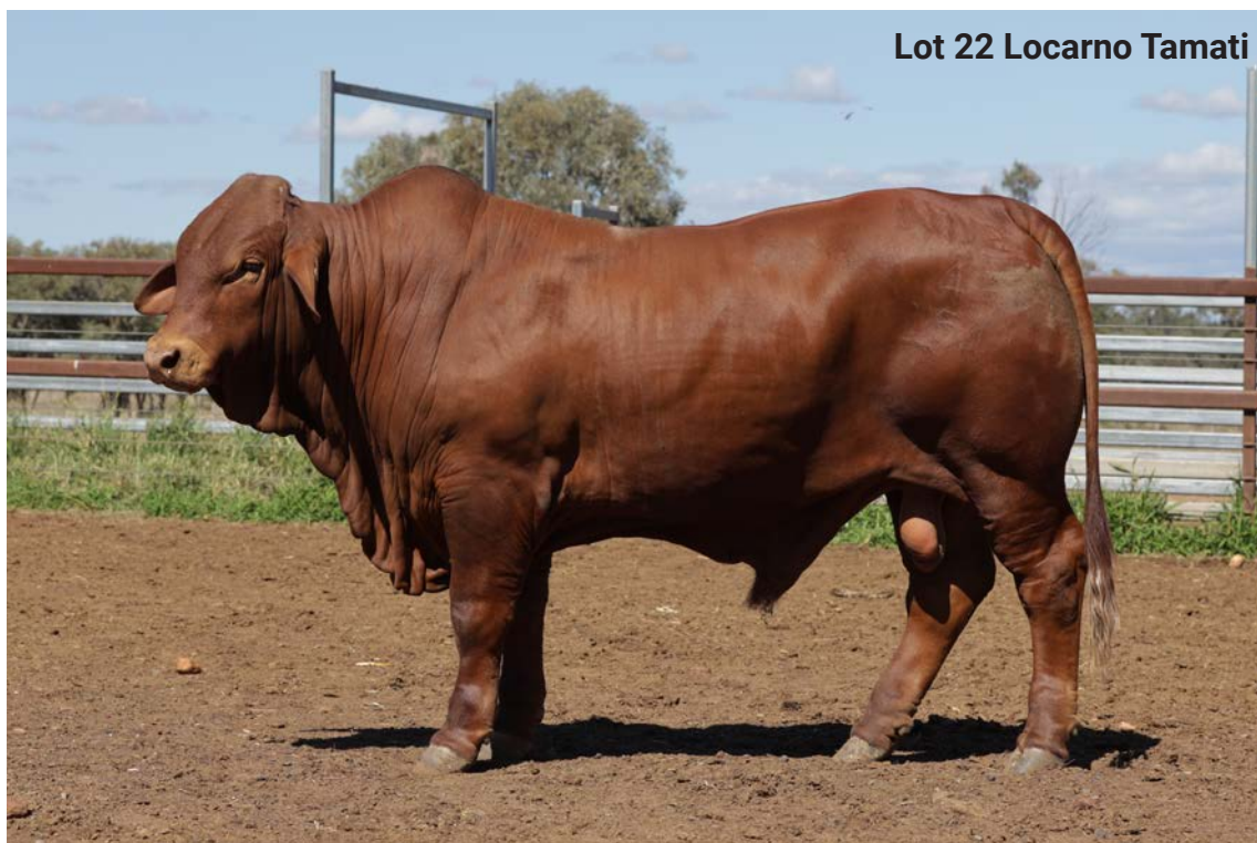
Lot 22 Locarno Tamati