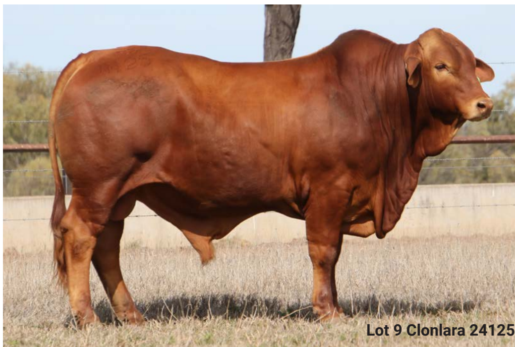
Lot 9 Clonlara 24125

Comments: 16032 - Calving interval 369 days. Eight calves in 8 years since first calving as a 2 year old. Four heifers, three are retained. Three bulls, 21282 sold to Warby Pastoral for $12,000, one sold privately for $5000 and 24125. She has just weaned another calf and is currently PTIC.